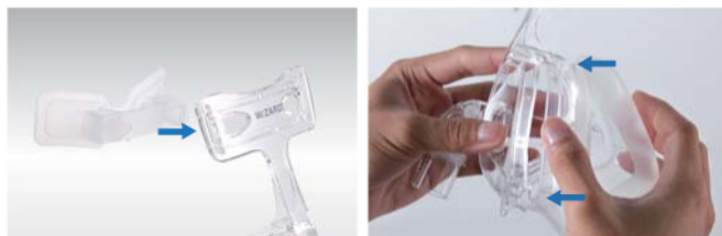
WIZARD 220 Exhaust Flow