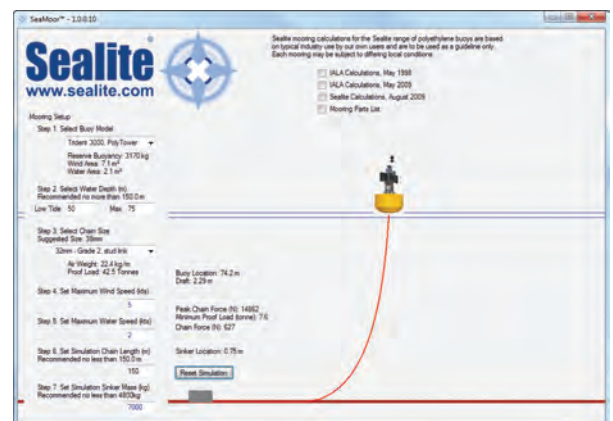
Mooring solutions are calculated using Sealite's advanced mooring calculator

The complete systems include chain, mooring sinkers and associated hardware in various grades and sizes.